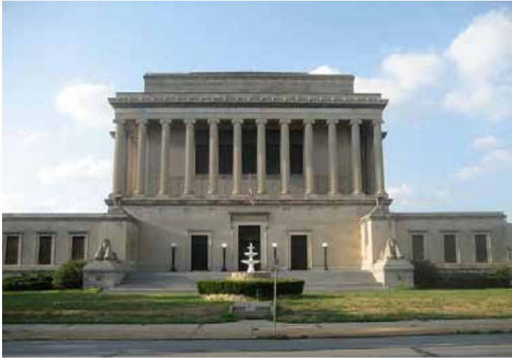
Kansas City Scottish Rite Building located at the intersection of Paseo and Linwood Boulevard.